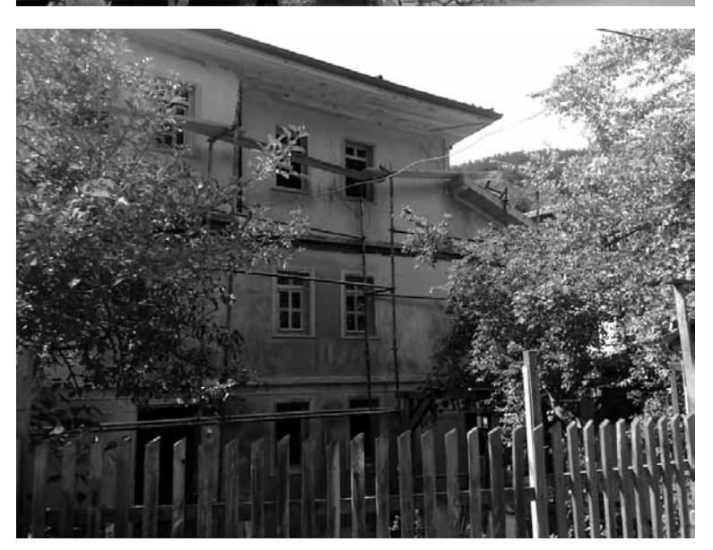
Figure 6. A traditional house of Mudurnu undergoing restoration works with funding from the Ministry of Culture and Tourism