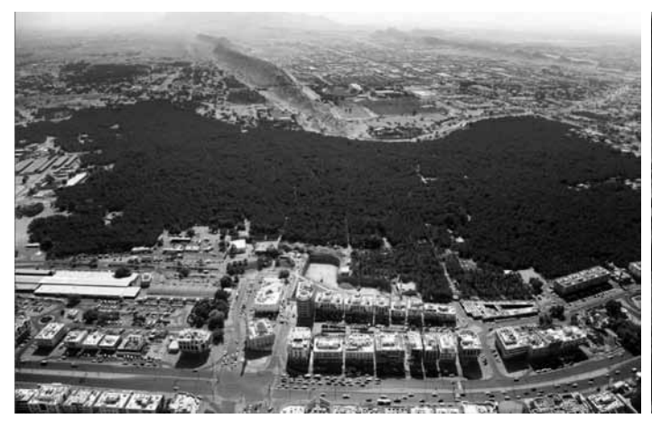
Figure 11 . Evaluation mission sent by UNESCO World Heritage Center leading up to the inscription of Al Ain on the WH List (photo: E. Yıldırım, 2010)