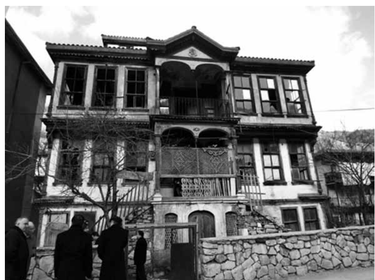
Figure 5. Delegation from İzzet Baysal University in front of Haytalar Mansion, Mudurnu, which the university planned to take over for restoration and reuse