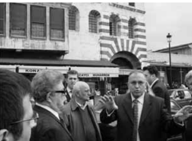
Figure 1 . Illustration of the Gaziantep 'Culture Trail Project' area (Gaziantep Metropolitan Municipality, 2008)