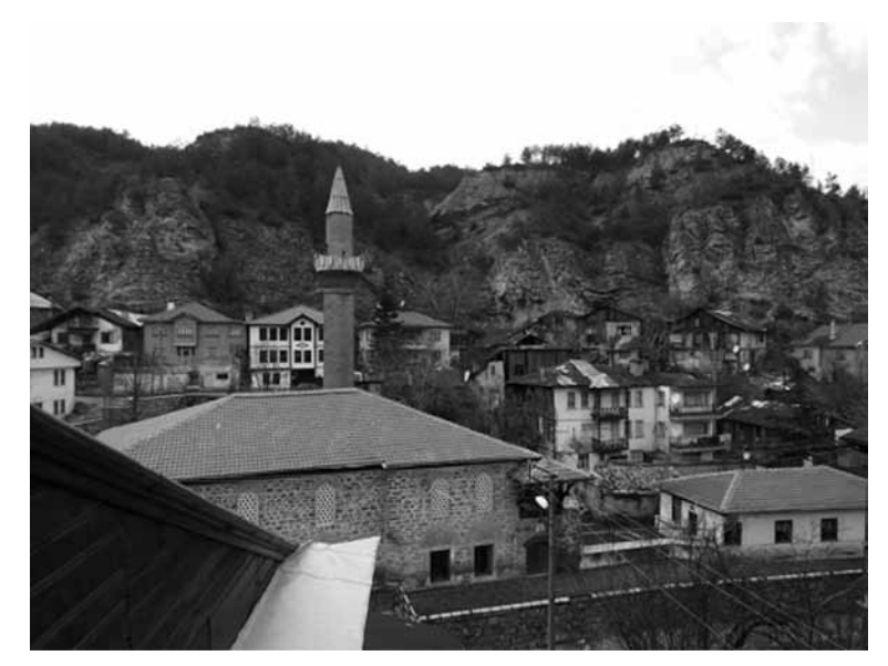
Figure 4 . Panoramic view of Mudurnu