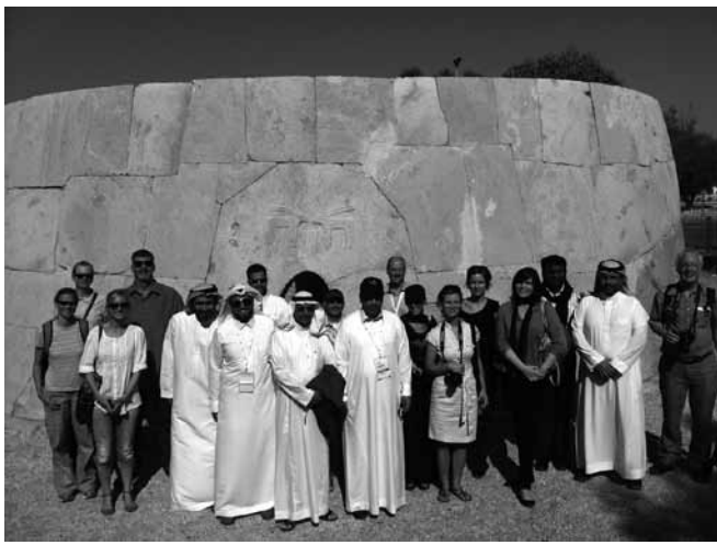
Figure 12 . Meeting of the Communication Strategy Team for the Al Ain World Heritage Site, Al Aİn (photo: E. Yıldırım, 2012)