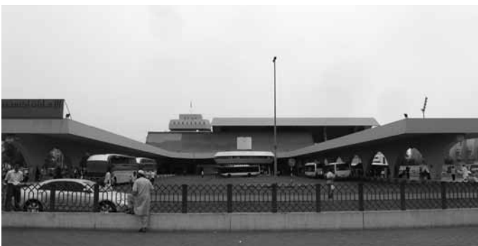
Figure 8 . Abu Dhabi Bus Station, c. 1970